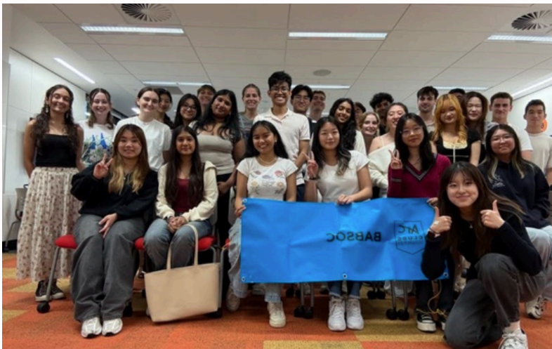
2025 BABSOC Committee Members

By partnering with BABSOC, sponsors gain direct access to the next generation of innovators, researchers, and entrepreneurs in the biosciences –future leaders who are eager to shape the world through cutting-edge research and technological breakthroughs.